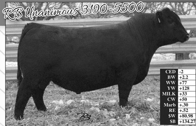
Reg. 18477271 • Sire: Vision Unanimous 1418 Dam: RB Lady Complete 890-3190 • MGS: Summitcrest Complete 1P55

Riley Brothers Angus has developed one of the premier outlets for performance bulls with added pounds, phenotype and exceptional number packages. We look forward to discussing our offering and feel free to stop by anytime.