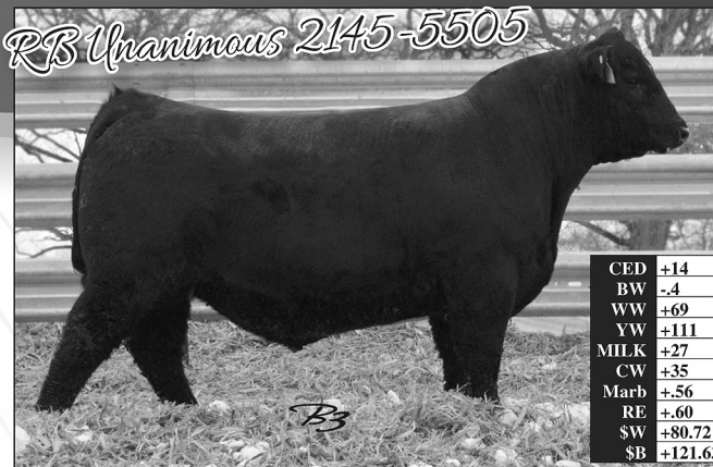
Reg. 18477270 • Sire: Vision Unanimous 1418 Dam: RB Lady Sterling 890-2145 • MGS: Haynes Sterling 924