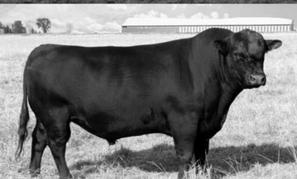
ELA EVERETTE Y512