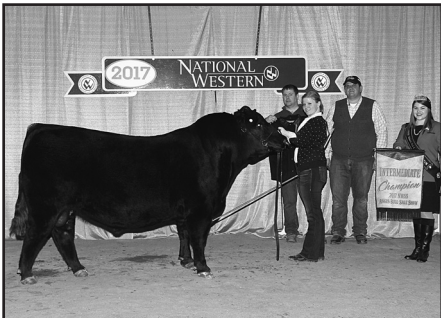
Marda Lone Oak Plymouth won intermediate champion bull at the 2017 National Western Stock Show's Angus Bull Sale Show. Lone Oak Angus, Brookfield, WI., and Marda Angus Farm, Lodi, WI., consigned the winning bull.