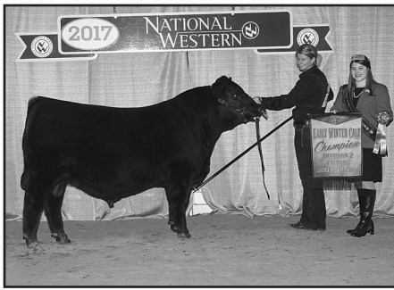
2K Innovation 26 won early winter bull calf champion - division 2 at the 2017 National Western Stock Show's Angus Bull Sale Show. 2K Cattle Enterprises, Glen Haven, WI., consigned the winning bull.