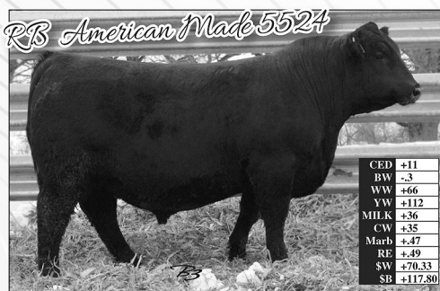
Reg. 18477345 • Sire: RB American Made 197 Dam: Gaffney Rita 083 • MGS: CAR Efficient 534