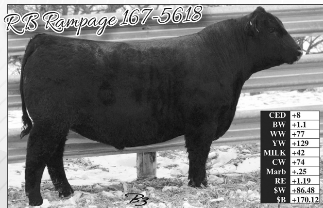
Reg. 18518644 • Sire: Quaker Hill Ramage 0A36 Dam: RB Lady Party 167-305 • MGS: Werner War Party 2417