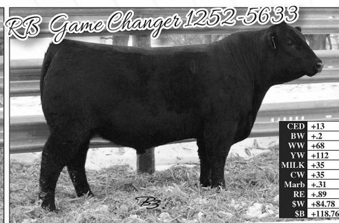
Reg. 18528582 • Sire: Gaffney Game Changer 371 Dam: Rock Creek Lady 844-1252 • MGS: GAR Objective 7125