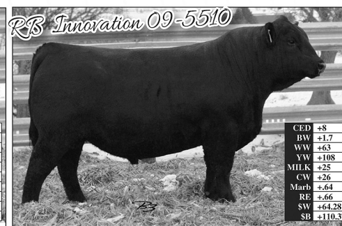
Reg. 18477275 • Sire: MAR Innovation 251 Dam: RB Lady Standard 305-09 • MGS: LCC New Standard