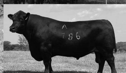
ELA 10X TRAVELER A786