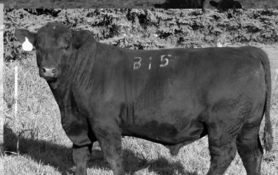
ELA CHIEF B15