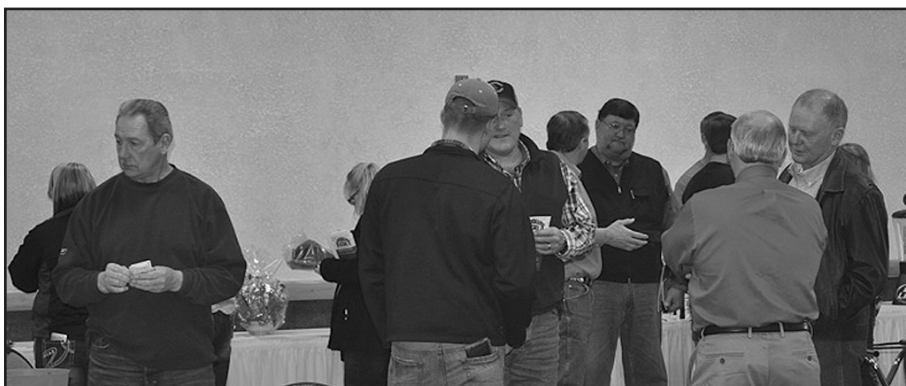
Come Join Fellow Angus Breeders at the Angus Association Annual Meeting, February 18