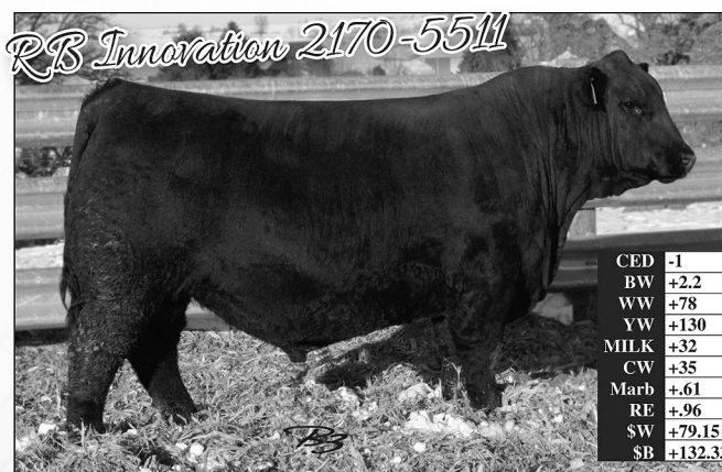
Reg. 18477277 • Sire: MAR Innovation 251 Dam: RB Lady 7125-890-2170 • MGS: GAR Objective 7125