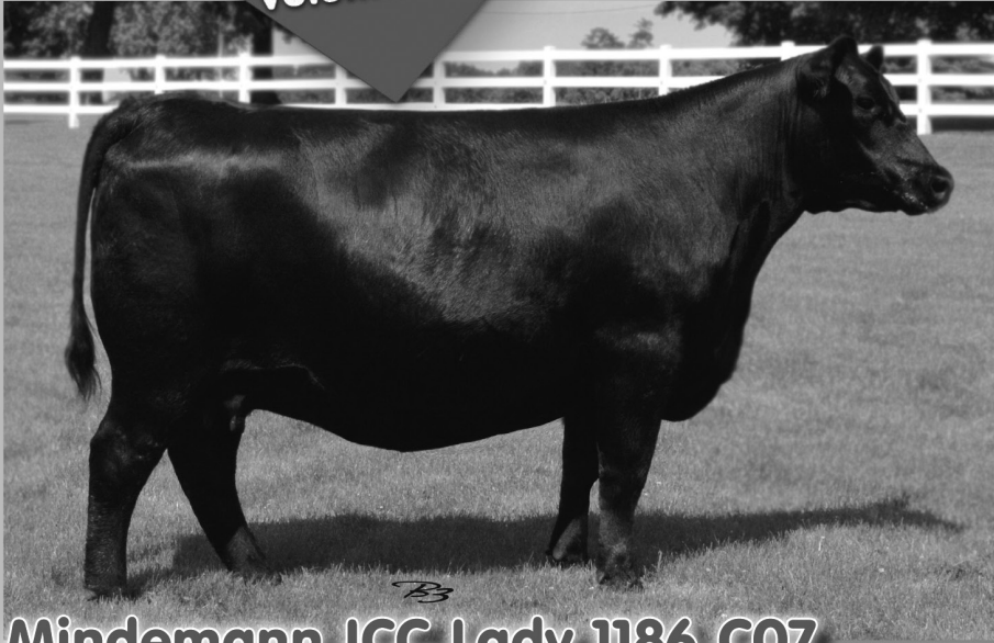
Mindemann ICC Lady 1186 C07

Featuring an elite offering of Angus Females!