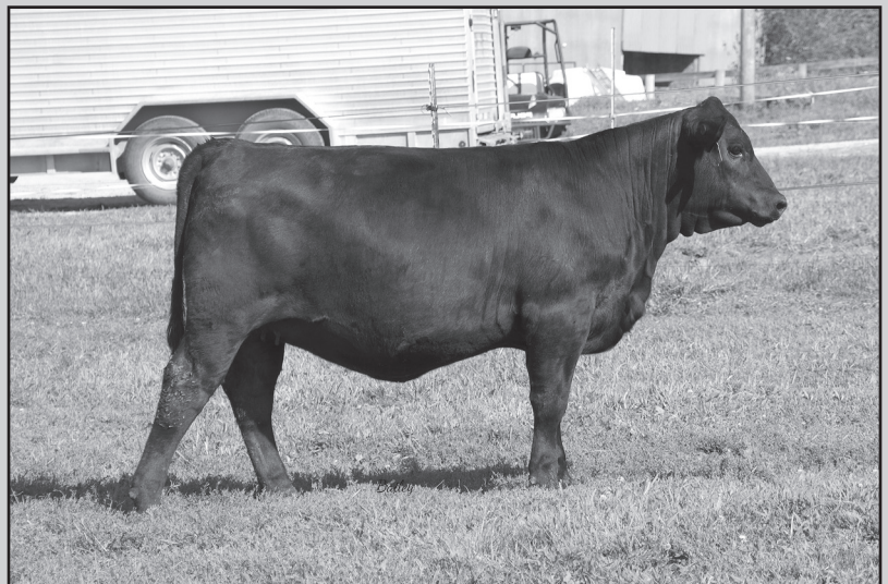
SPRING CREEKS BEAUTY 7033 – Selling this February heifer by Quaker Hill Rampage 0A36 from a dam by Mytty In Focus, from the Beauty family.