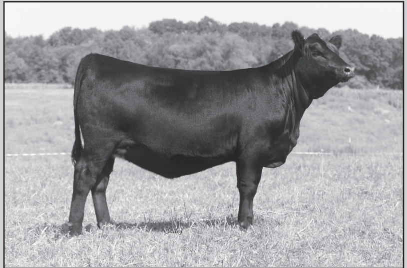
MARDA ASTI 732 – WR 116 , Selling buyer's choice of this January heifer by Baldrige Willie Y34 or Marda Asti 726 by VAR Discovery 2240, from the same dam as both the $21,000 Marda Willie Nelson 564 and the cow who produced the $29,000 Marda Asti 621.