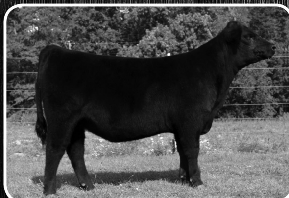
807 :: February :: Colburn Primo

Other Sires Represented: SMA Watchout, EXAR Classen, Penners-CC Double Black, PVF Insight