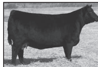
MRCC Kinochtry Beauty 9585 A fancy show heifer by this outstanding female sells by EXAR Totally Tuned 71281.