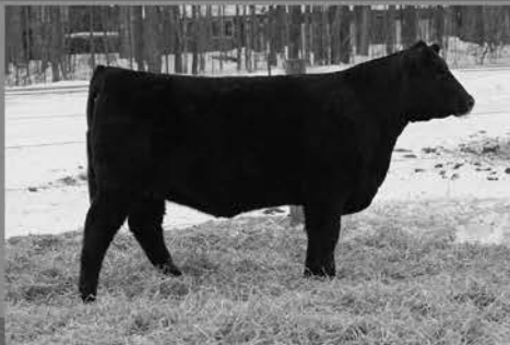
TAG: J425 JSAR MR. RODMAN X OCC EMBLAZON 854E