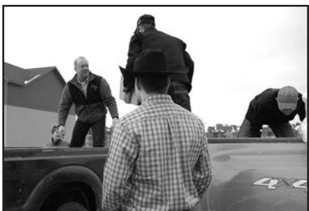
The Wisconsin Junior Angus Association annual fund raiser was a huge success, selling 28 pound bundles provided by Country Fresh Meats. Pictured are juniors unloading the truckload of bundles