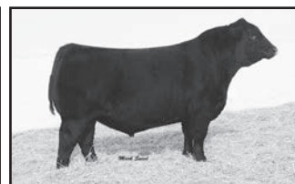
RB Active Duty 010