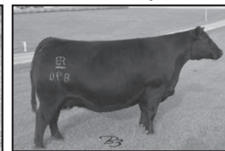
RB Lady Standard 305-890 The breed-leader for phenotype and EPDs, a maternal sister is the dam of a featured AAR Ten x7008 SA bull sells.