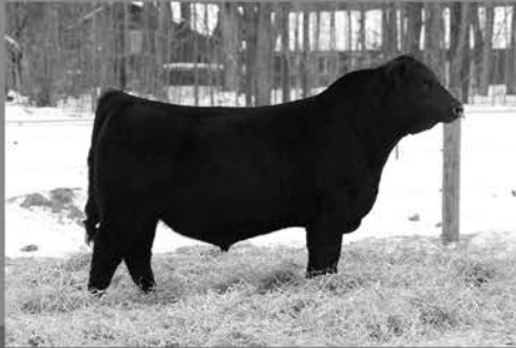
TAG: J402 MACTL BY-PRODUCT X PVF ALL PAYDAY

MAY 9TH, 2015 1 P.M. CENTRAL TIME AT S&R ANGUS