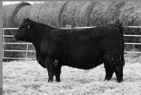
TAG: 31B MACTL BY-PRODUCT X VRD SON