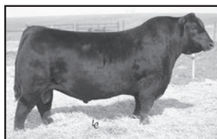
RB Tour of Duty 177