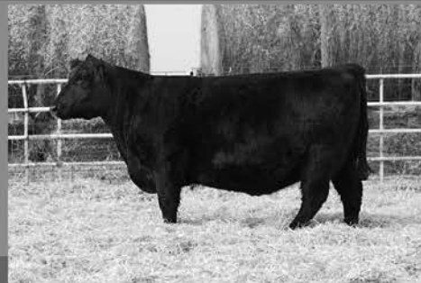
TAG: 65W BEB JUNEAU X BR MIDLAND