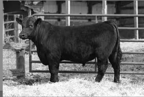
TAG: 65B VA FIRST ROUND X TC FREEDOM