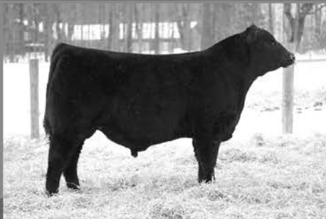
TAG: J424 SILVEIRAS STYLE 9303 X OCC LEGEND SON