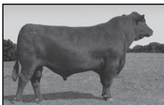
AAR Ten x 7008 SA

Held In Conjunction With The Black River Spring Thaw Jackspot Show