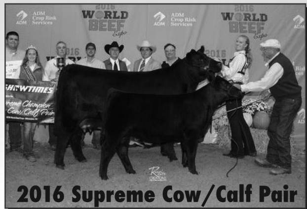
2016 Supreme Cow/Calf Pair