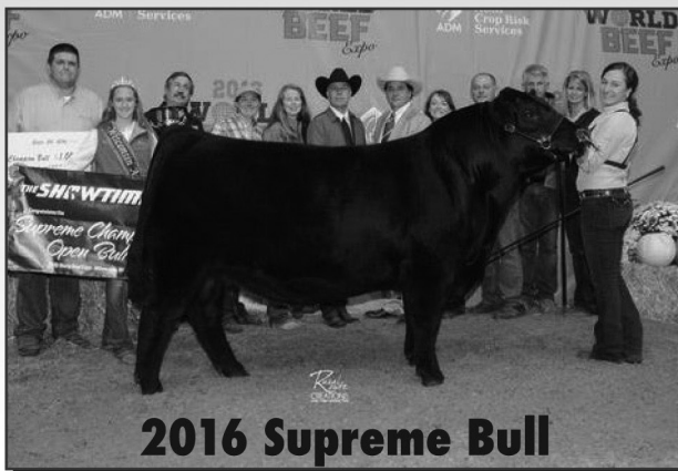
2016 Supreme Bull

September 22nd thru September 24th MULTI BREED & CLUB CALF SHOWCASE SALE SATURDAY, SEPTEMBER 23RD, 2017